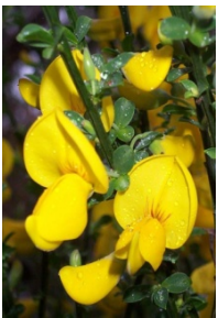
Scotch broom flower

Scotch broom, Cytisus scoparius , is in the spotlight for the month of July. This class four noxious weed occurs in small patches across the Council area.