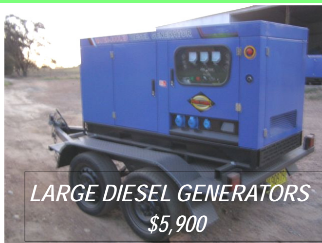
LARGE DIESEL GENERATORS $5,900