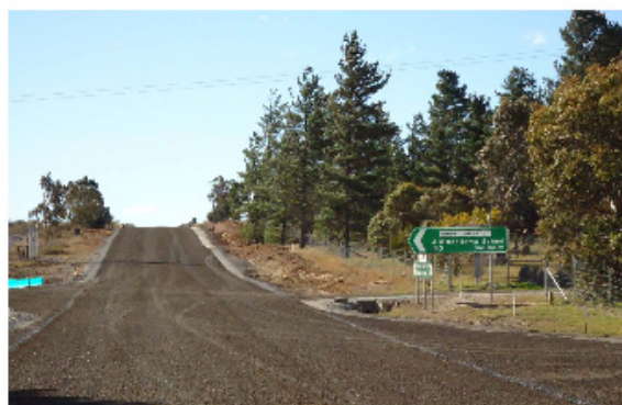
Windellama & Oallen Ford Road Intersection