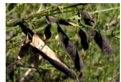
Scotch broom pods

The shrub grows to 3 meters tall, with main stems up to 5 cm and during spring will display small green deciduous leaves and bright yellow flowering. Scotch broom is a hardy shrub tolerating temperatures down to about -25°C and contains toxic alkaloids that can depress the heart and nervous system.