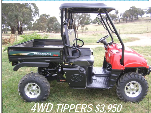
4WD TIPPERS $3,950