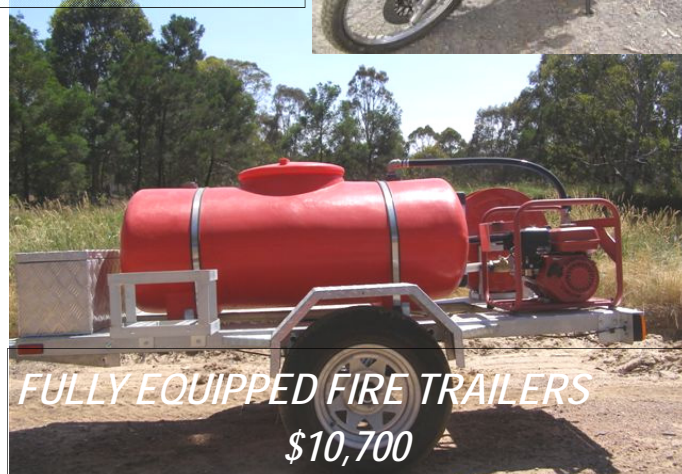
FULLY EQUIPPED FIRE TRAILERS $10,700