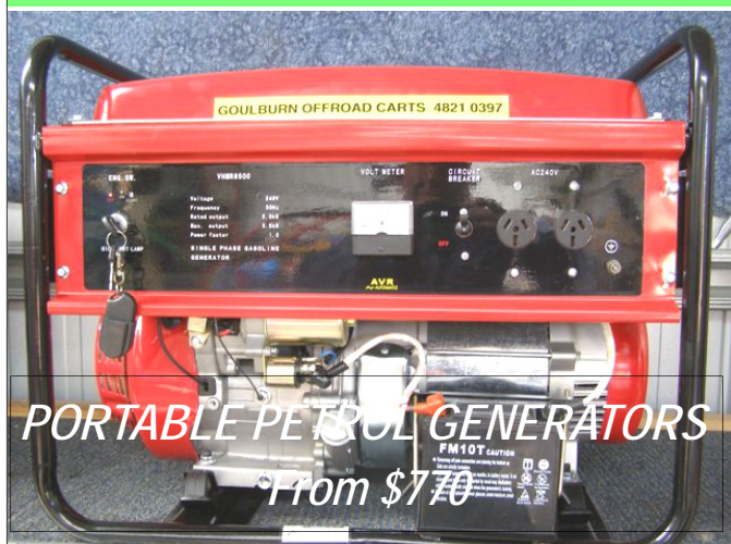
PORTABLE PETROL GENERATORS From $770