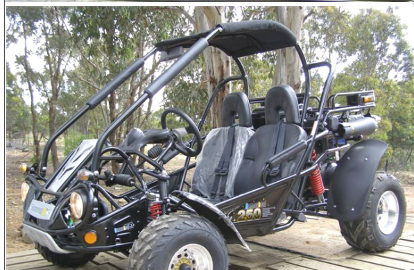
CARTS & BUGGIES From $3,300