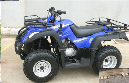
FARM BIKES $2,600