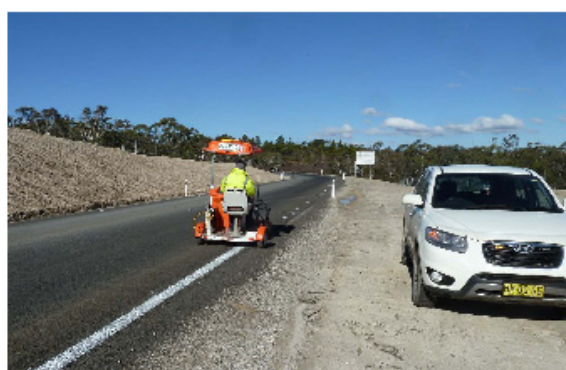
Oallen Ford Road