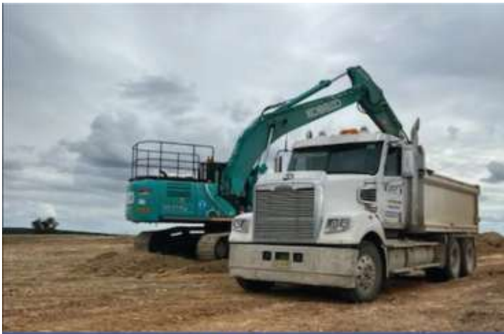
BIG AND SMALL JOBS