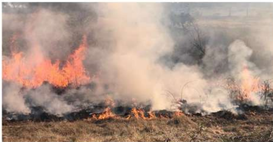
Photo – one of the many incidents we attended during July

In an emergency or if you see an unattended fire call Triple Zero (000)