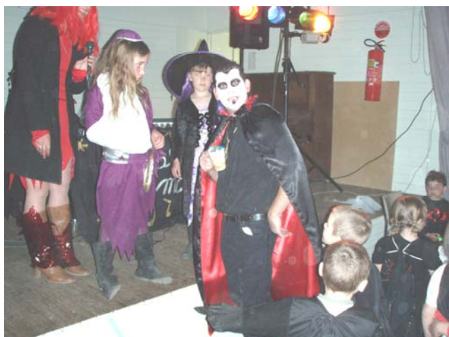
Monster celebration snapshots

You may become a member of STFFN (membership is free) and members receive quarterly newsletters, and attend field days on various aspects of farm forestry.