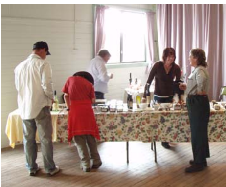
Field Day snapshots