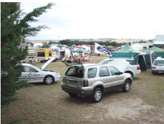
Field Day snapshots