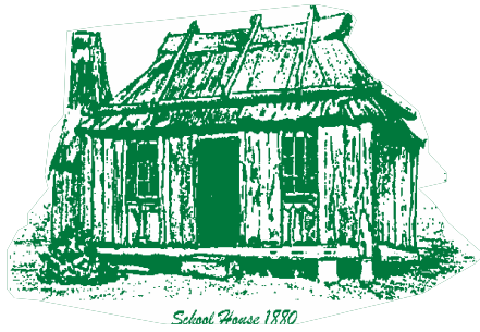
School House 1880