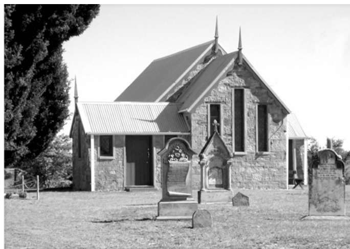
St. Bartholomew's Anglican Church

1st Sunday of each month 10.30am Enquiries: 4842 2444