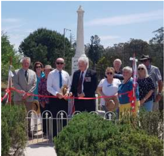
WM Bungonia opening Donors cutting ribbon 2023

So here today at Bungonia we see the result of our community effort in restoring our war memorial. I wish to give thanks to those who donated towards the cost of the