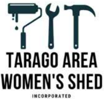
COMMUNITY. LEARN. CREATE.

Our Sausage Sizzle at the Bungendore IGA was