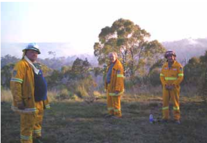
Part of your fire crew having a break while awaiting more instructions