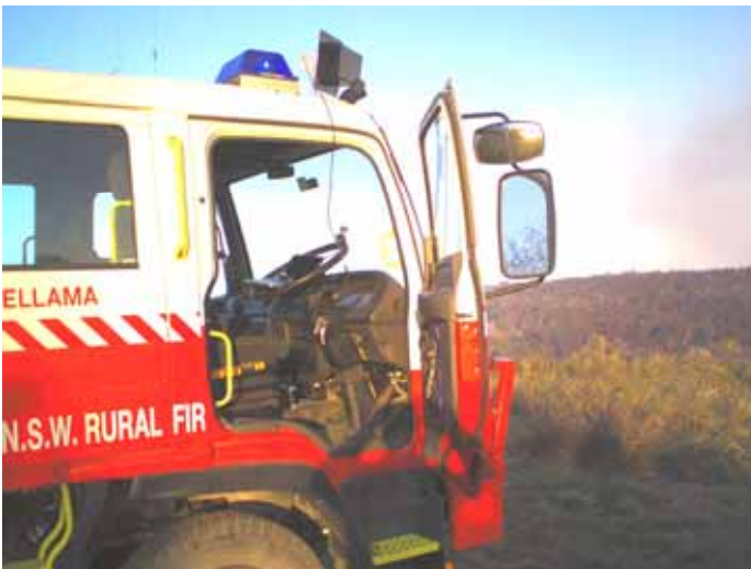
Uploading live images of fire