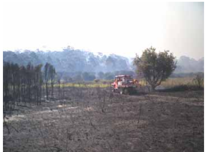
One fire out, off to the next one