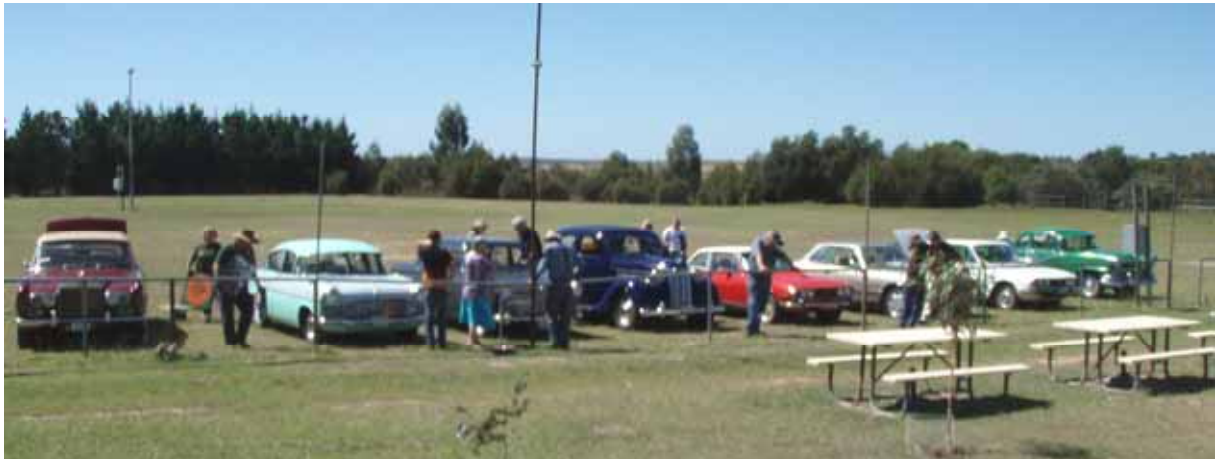
Just some of the classic cars that came to the January Markets from the Southern Tablelands Heritage Auto Restorers Club