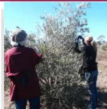
Katie & Ni chatting and picking

before Anzac Day as we used to do – then we should miss early frosts & bird strike on ripe olives and at least end up with a worthwhile crop of olives (this year's harvest was only about 10kg, much the same as last year's). A short time harvesting was followed by the traditional sausage sizzle under our carport sheltered from the west. We gave up battling to keep tablecloths on tables with the gale force winds last year, so this year we didn't bother about tablecloths just in case. Would you believe it, gale force winds struck again, but changing direction just to attack us – glasses, plates & people flying through the air all around us, oops.