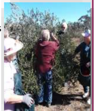
Wow this tree is loaded

is going back to nature, and the bulbs she gave us last month are starting to sprout at Dreamers Edge, so we're all anxious to see what they are. Katie picked her kiwifruit as advised & has been waiting over 2 weeks for them to ripen with no luck – others thought apples in with them might help ripen them. Her tomatoes have been rotten underneath – it could be a virus (you need to rotate beds each time you plant), or too much moisture, or their bottoms are too close to the ground (oh to have a photo of that).