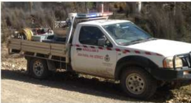
The 2001 Nissan Navara that has now been retired

While not as iconic as our previous early 1980's Cat9 which was sold to the Australian Museum, the Nissan Navara still provided many years of solid service including being operated almost 24/7 for 3 months during the 2019/20 Black Summer Fires.