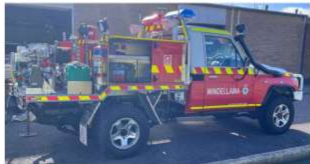
Windellama's 2023 Toyota Landcruiser

Thinking of burning? There are some rules that you must follow to make it safer for you and your neighbours. You must notify all adjoining neighbours and the RFS Fire Control Centre using the online form www.rfs.nsw.gov.au/fire-information/BFDP/burn-notifications or by calling (02) 6226 3100) at least 24 hours before lighting up.