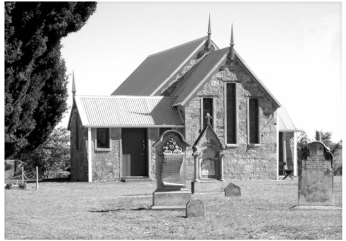
St. Bartholomew's Anglican Church