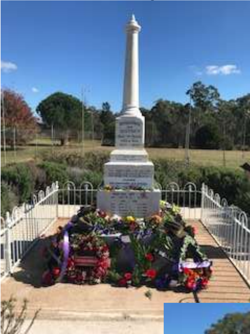
Windellama Progress Members at Anzac Day