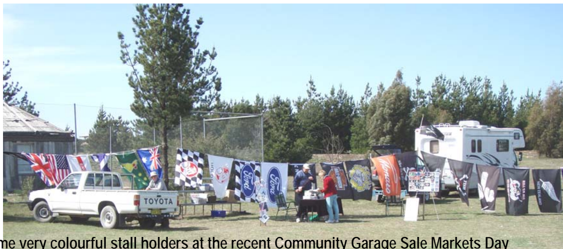
Picture of some very colourful stall holders at the recent Community Garage Sale Markets Day