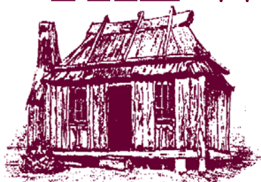
School House 1880

Windellama Progress Association Hall Inc. Vol. 14 no. 9 - October 2010