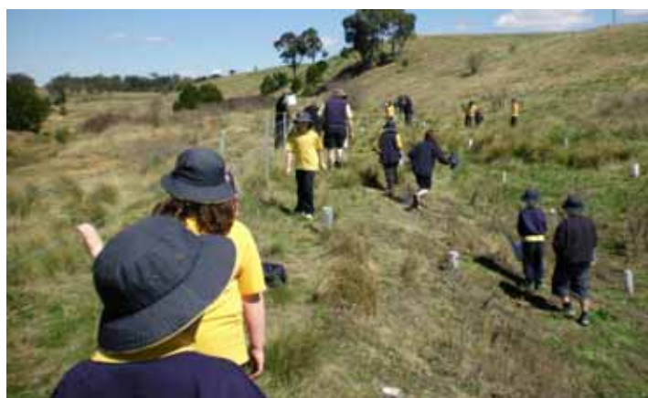
Tree Planting photos courtesy of Felicity Sturgiss