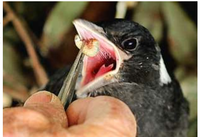
A young magpie in care about to enjoy a juicy treat from the carer's garden.

Magpie and plover swooping can be a problem at this time of year. They only swoop to protect their territory and nest, and will only act in this manner at breeding time. Magpies are territorial and cannot be relocated. In springtime when they have eggs or young, if the offending adult bird was to be relocated there would be no parent bird to look after the young, and they would starve to death. You would also have another Magpie move in as soon as the territory became vacant. Magpies usually build their nest fairly high up in the trees, the basket like nest is made from sticks leaves and grasses, they make use of things like string, rope, wire,