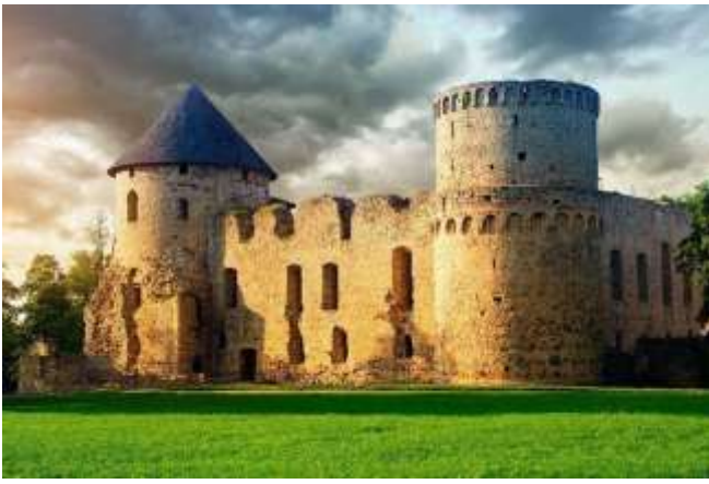
Photo: Cesis castle - https://traveltriangle.com/blog/latvia-festivals/