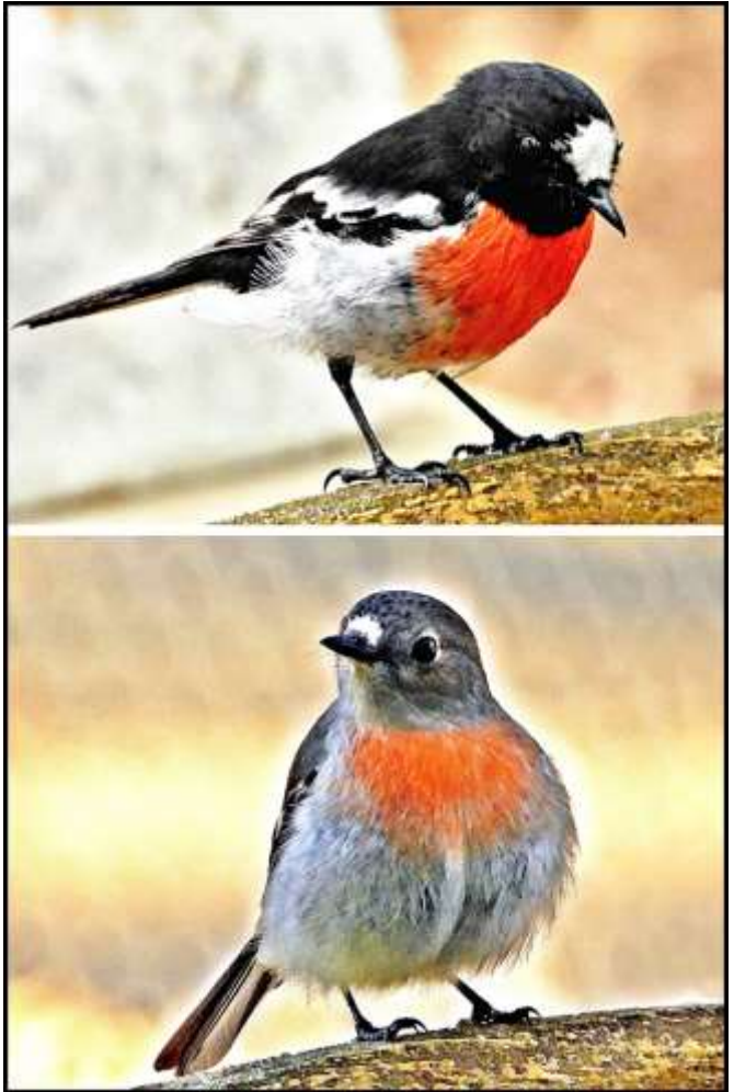
The 'vulnerable' Scarlet Robin ( Petroica boodang ) Male at top, female below.