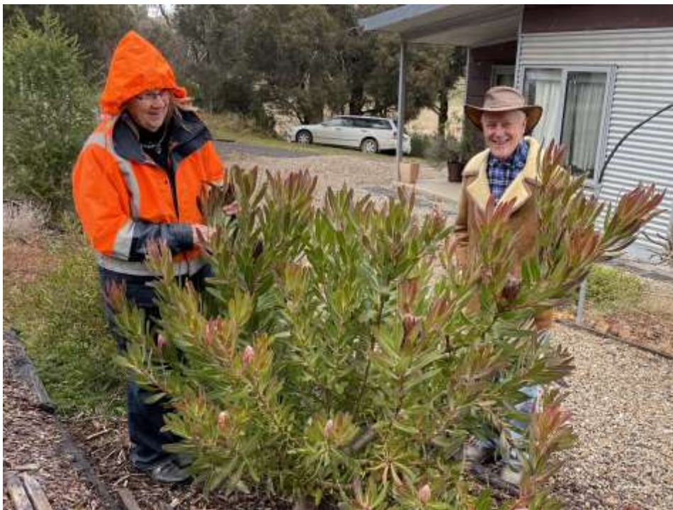
Admiring the protea.

The weather was typical of August, windy with rain squalls, punctuated with the odd bit of sunshine to entice us out to wander around their gardens, only to be caught by another rain shower. Fortunately, the glasshouse that Owen built was on hand to provide some much needed shelter until the rain had passed.