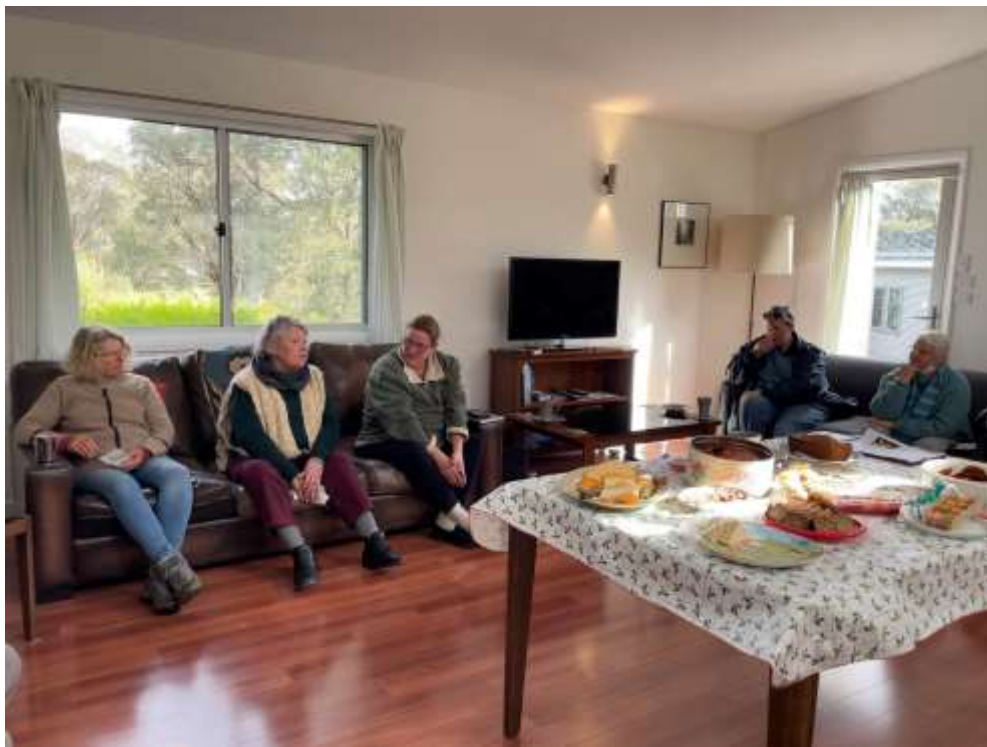
Enjoying a cuppa.

This is a good time of the year to be busy pruning fruit trees and roses, and spraying deciduous trees against fungal and bacterial attacks, which can do a lot of damage once the new growth